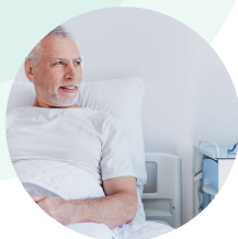
TruDoc's Hospitalist Program When at the hospital