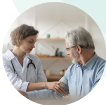
TruDoc's Hospital At Home Program When at home