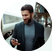
TruDoc App When traveling