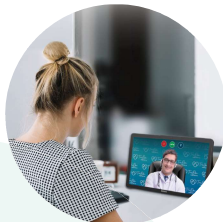
TruDoc's Virtual Clinic When at the office