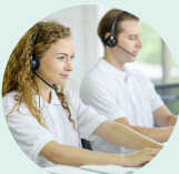
TruDoc's 24/7 Doctor Call Center